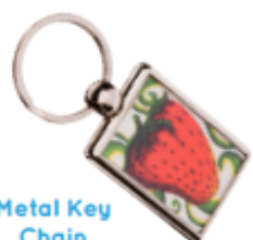
Metal Key Chain